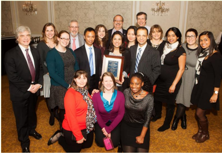
Members of the Oncology Pharmacy Services Team