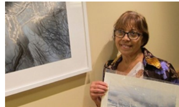
Calming Riverine Views Flow Into Cancer Center