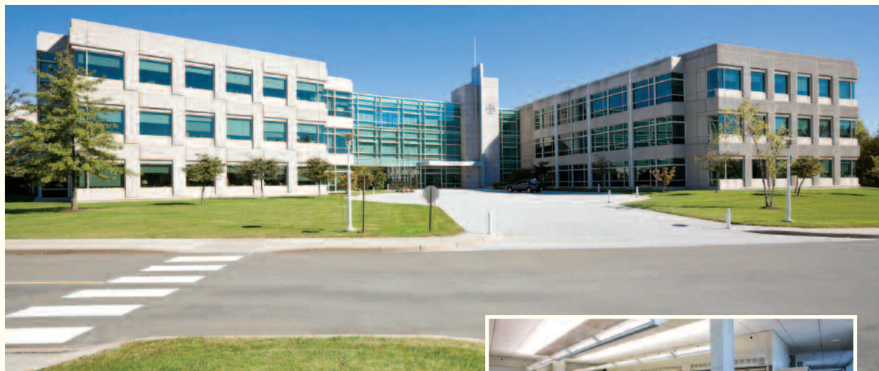
The former Bayer complex in West Haven.

» West Campus Expansion continued from page 1