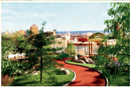
below top: Healing Garden below bottom: Cancer Center Lobby

For online information please go to yalecancercenter.org/involved